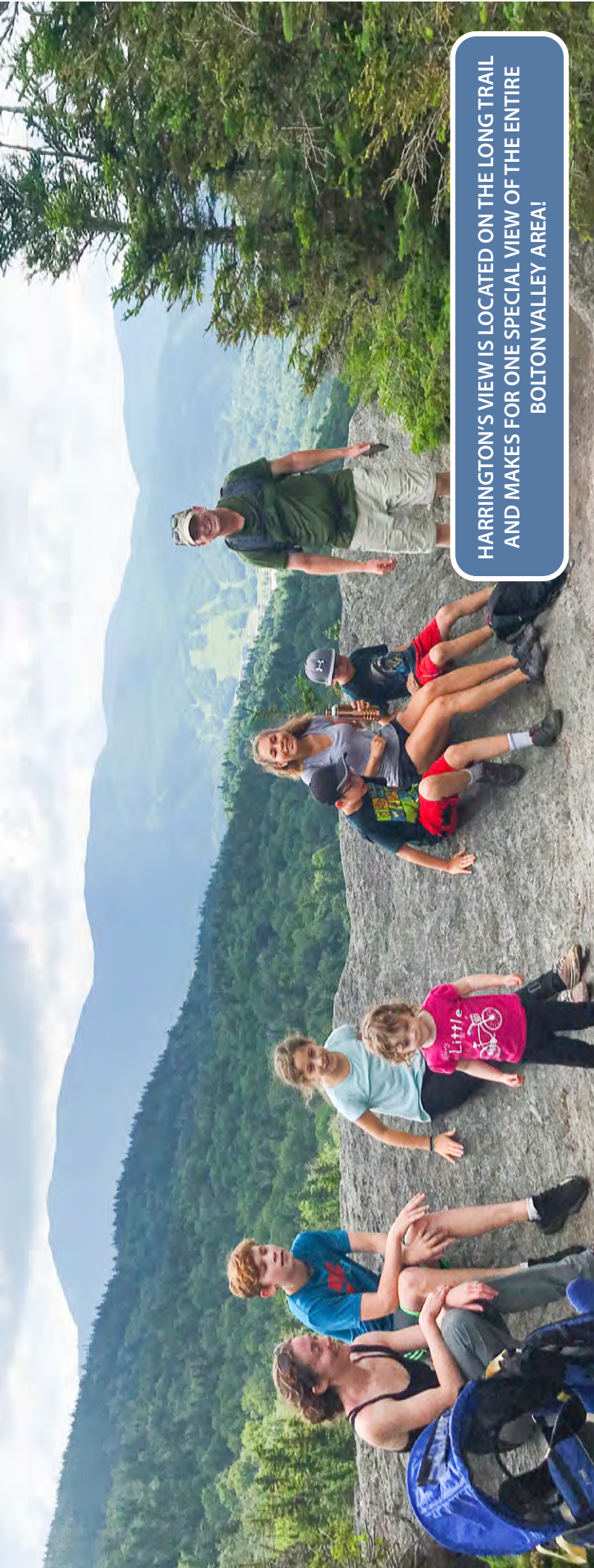
HARRINGTON'S VIEW IS LOCATED ON THE LONG TRAIL AND MAKES FOR ONE SPECIAL VIEW OF THE ENTIRE BOLTON VALLEY AREA!