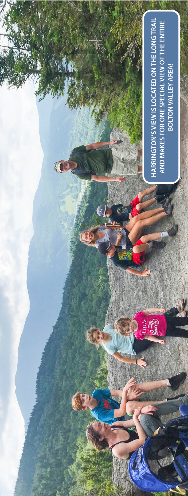
HARRINGTON'S VIEW IS LOCATED ON THE LONG TRAIL AND MAKES FOR ONE SPECIAL VIEW OF THE ENTIRE BOLTON VALLEY AREA!